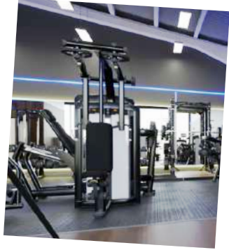
Gym Visual Renders