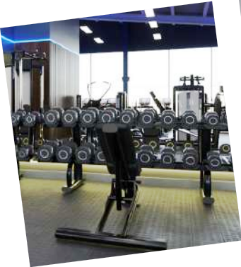
Gym Visual Renders