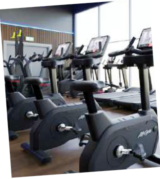
Gym Visual Renders